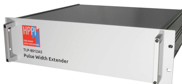
(a) TLP-8012A5 front side

The pulse width can be selected manually on the backside of the TLP-8012A5 using two high voltage port selection cables.