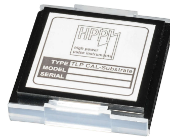
Figure 2: Protective case.

is 30.67 mm x 29.33 mm. The total height including reference devices is maximum 2.5 mm. The substrate is packed in a protective case.